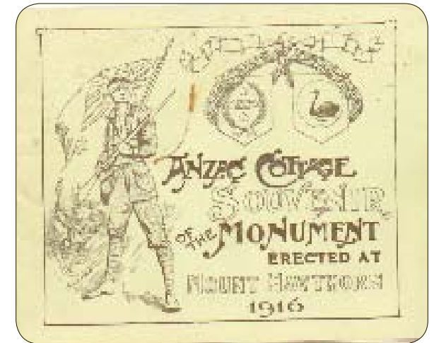
Above: Cover of the Anzac Cottage souvenir booklet, 1916.

the mythology and of all the powerful meanings that have been infused into the words 'Anzac', 'digger' and 'Gallipoli'. History and folklore are the glue that holds this all together, bonding the local, the familial and the national. 12