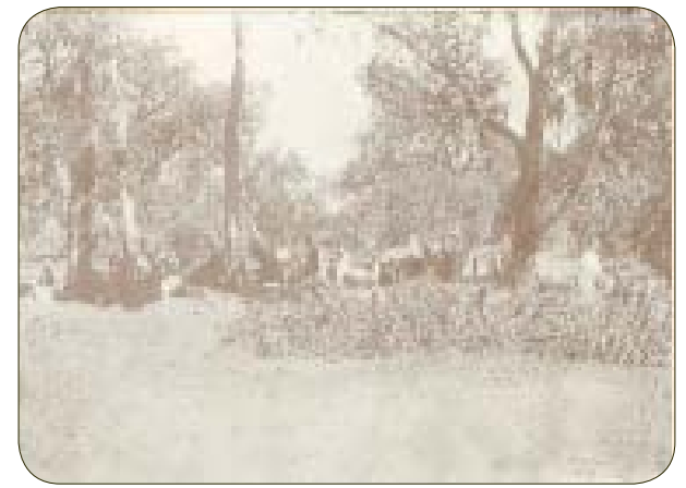
Above: 'Busy Bees' clear the bush block that will become Anzac Cottage 8