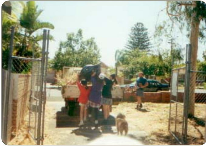
Above: Local residents perform voluntary preparatory work for the restoration of Anzac Cottage.

folklore. This is an example of the characteristic ability of Anzac to evoke the sacred through the secular. 9