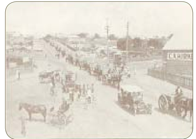
Above: Drays full of donated building supplies leave Perth for the Anzac Cottage building site, February 1916.