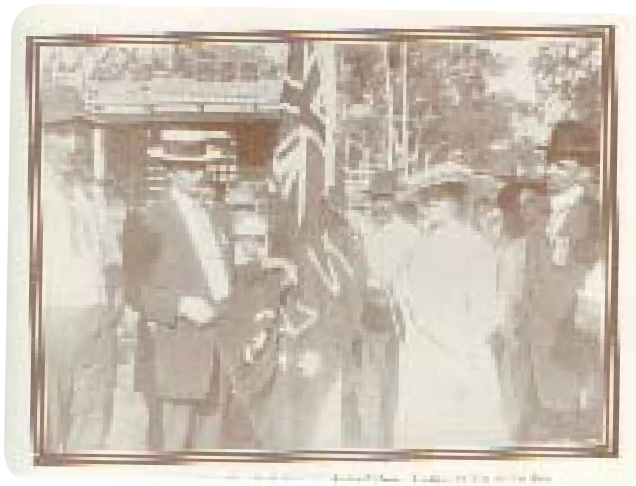
Above: Raising of the 'Anzac' flag

4) The symbolic power of the names Gallipoli and Anzac, and the motifs that were originally part of the Cottage's decoration also partook of this metaphor.