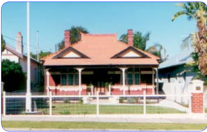
Top: Anzac Cottage restored, c. 1998