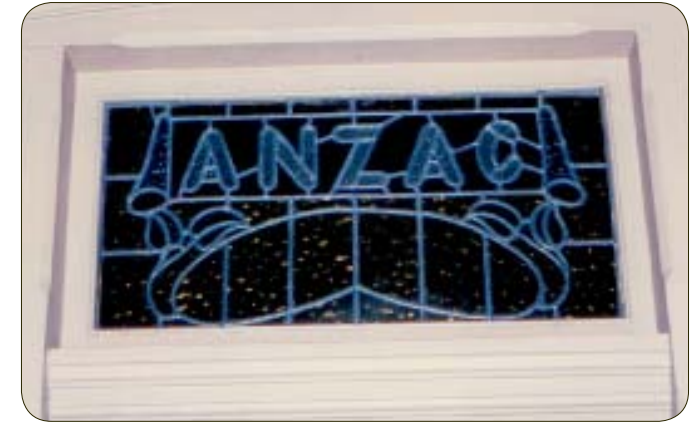
Above: The only surviving Gallipoli feature restored and replaced 1998

4) The symbolic power of the names Gallipoli and Anzac, and the motifs that were originally part of the Cottage's decoration also partook of this metaphor.