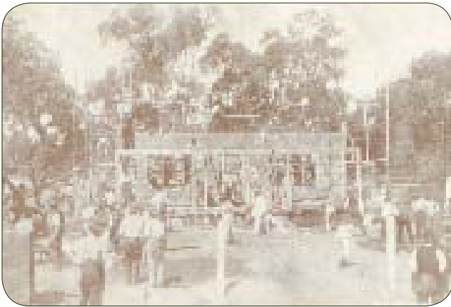
Above: Progress on the building by 2pm

3) The modified Australian flag was and, in its modern copy, is, a revealing metaphorical conflation of the official and the folkloric that is an important part of the cultural energy that fuelled the Anzac mythology.