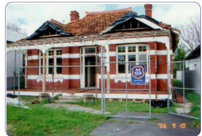
Above: Anzac Cottage derelict in 1916

and labour. It was constructed, it is claimed, in just one day in February 1916 as a home for an Anzac hero and family to inhabit forever. I have written about this in more detail but today want to look briefly at the way in which this early expression of the national, state and local gratitude for the sacrifice of the Anzacs – as well as the subsequent iterations and folklore of the mythology - are enshrined and perpetuated through this community memorial.