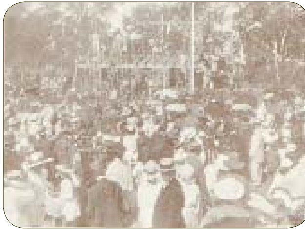
Above: The laying of the foundation stone

3) The modified Australian flag was and, in its modern copy, is, a revealing metaphorical conflation of the official and the folkloric that is an important part of the cultural energy that fuelled the Anzac mythology.